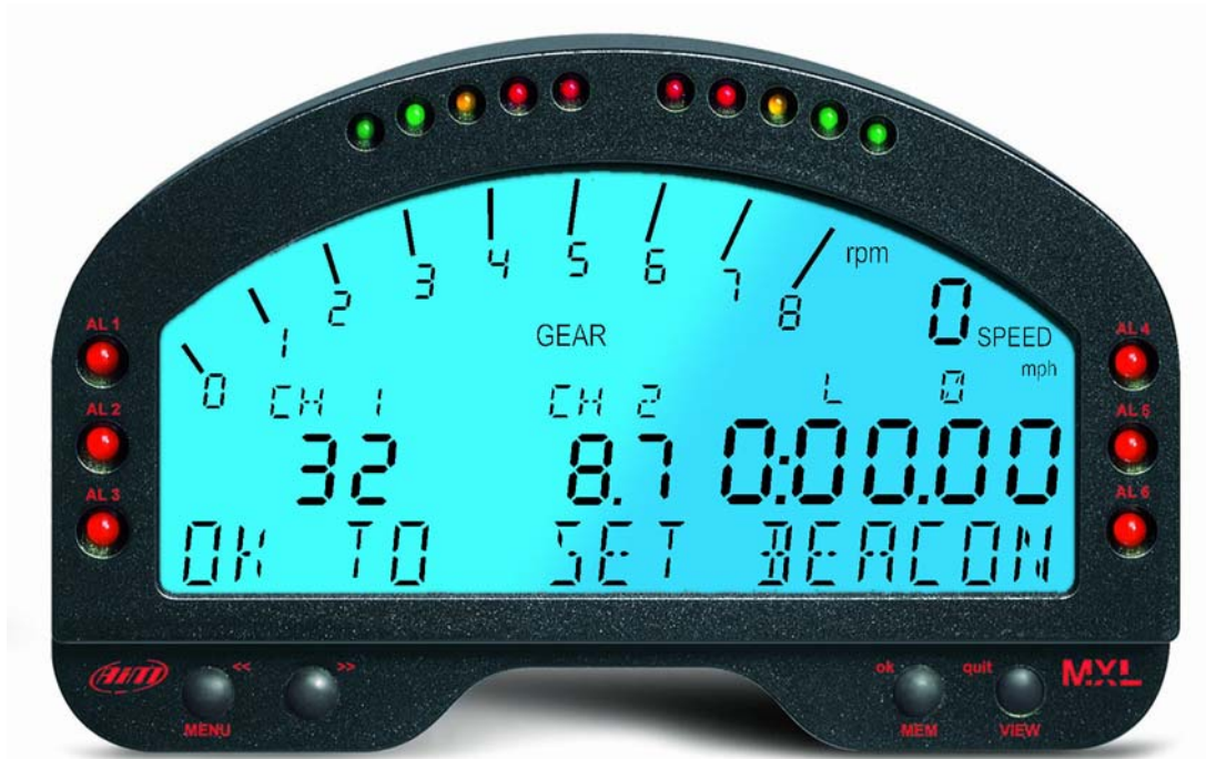
Figure 2. Press the “OK” button to set the start/finish line.

Press the OK button to begin settings. The MXL will now ask for beacons as shown below in figure 2.