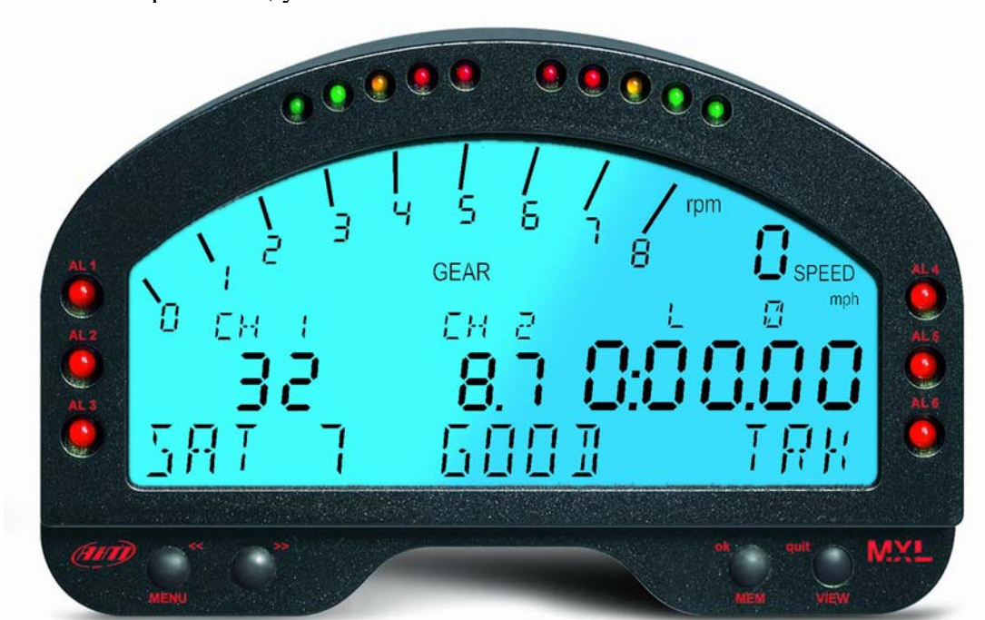
Figure 4. System ready for GPS Lap timing.

You may follow this procedure either while the vehicle is moving on track, or while stopped. Once the configuration is over, the main page (figure 4) will appear automatically and you will be ready to acquire lap times. The “TRK” info in the lower right part of the display means that the current track has been recognized and the system is ready to get GPS Laptime and split points. If you wish to abort procedure, you have to restart the MXL.