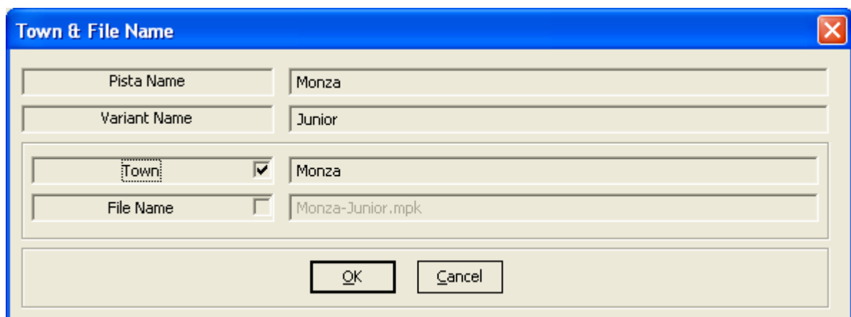
Figure 6. Creating file name for given GPS configuration