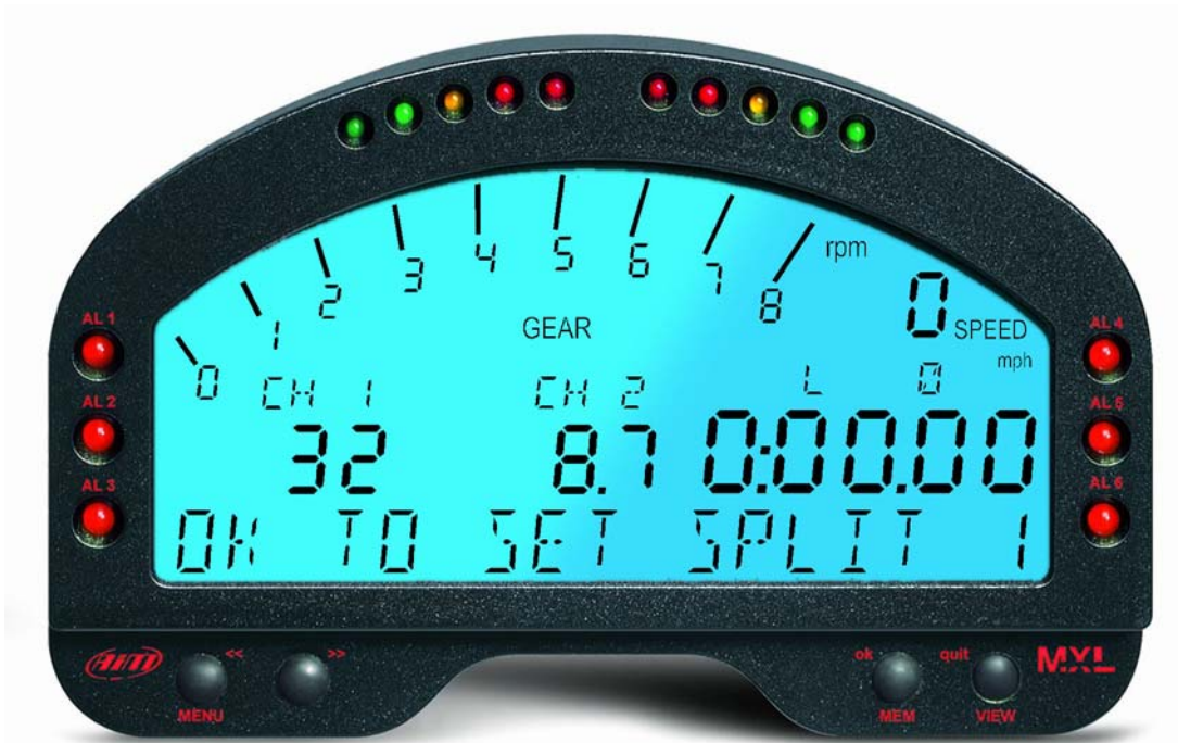
Figure 3. Press “OK” button to set the split locations individually.

You may follow this procedure either while the vehicle is moving on track, or while stopped. Once the configuration is over, the main page (figure 4) will appear automatically and you will be ready to acquire lap times. The “TRK” info in the lower right part of the display means that the current track has been recognized and the system is ready to get GPS Laptime and split points. If you wish to abort procedure, you have to restart the MXL.