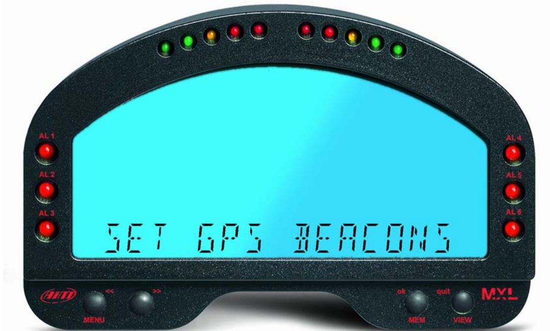
Figure 1. “Set GPS Beacons” on MXL

Switch to the “Set GPS Beacons” page (figure 1) by pressing the Menu Button. This can be done either with engine running or not. If the engine is running, the Menu Button will not only turn backlight on/off but it will give the possibility to set GPS beacons too.